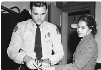
(Rosa Parks being finger printed marking the beginning of the Montgomery Bus Boycott)

During this era, the thrust was social change. Thousands of Omega men in every area of the country were actively involved in the fight to eliminate racial discrimination.