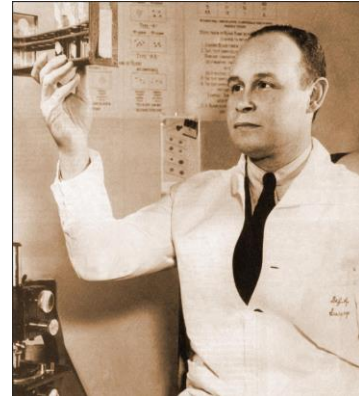
(Brother Charles Drew)

use of blood plasma as a lifesaving tool. William Hastie resigned as Civilian Aide to the Secretary of War in protest against discrimination in the Armed