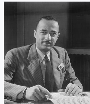
Senior Judge of the United States Court of Appeals for the Third Circuit